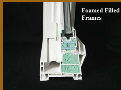
Foamed Filled Frames