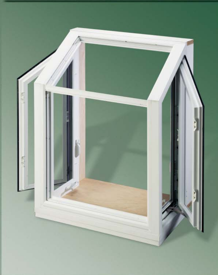
Series 2050 Garden Window